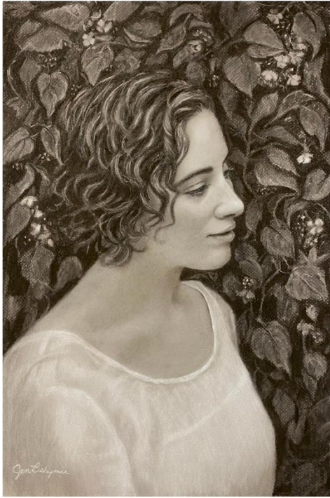
"Reverie" Charcoal and White Chalk. by Jennifer Behymer

The skills you gain in learning to draw can easily translate into painting or any other art form you care to enjoy. This 10-week course will cover drawing fundamentals, including measuring to get a drawing off to a good start, along with the basics of composition, value and gradients, edges, and one and two point perspective. Students will be introduced to a variety of strategies to improve drawing skills and boost self-confidence including one class with a live model. Classes will begin with a demonstration, after which students will work individually from provided reference photos. Students are also welcome to bring their own reference photos. This class is suitable for absolute beginners to more advanced students who are looking to brush up on their drawing skills. The class will introduce students to both graphite and charcoal and the many beautiful effects that can be achieved with these versatile media.